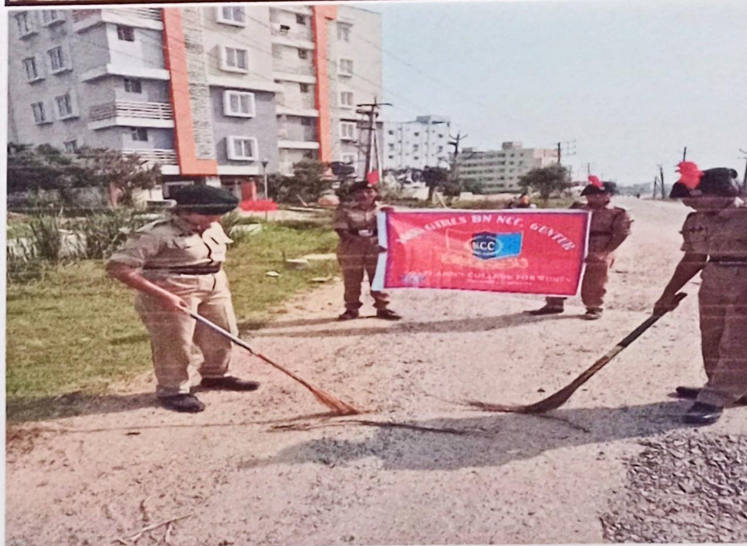
Cleaning surroundings by NCC cadets